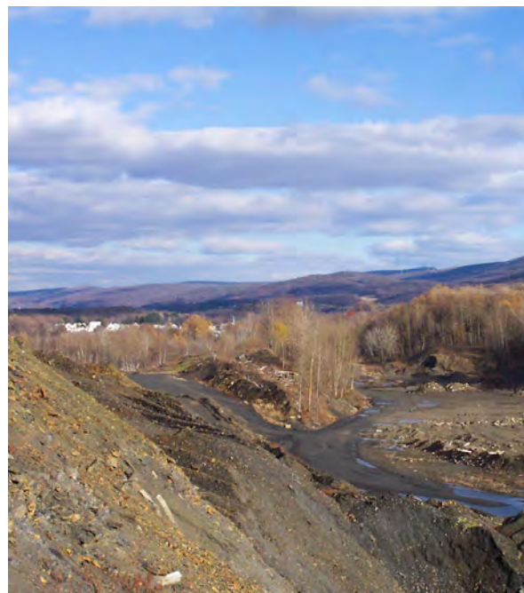
Construction is underway to clean up culm banks and other mining damage at the Bliss Bank site.