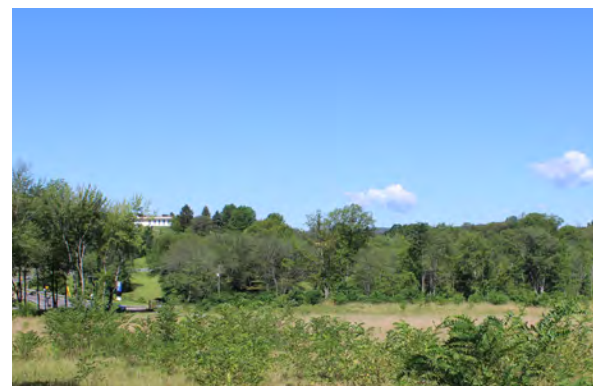
The entrance to Luzerne County Community College is just visible across this reclaimed section of Hanover 9, Parcel A.