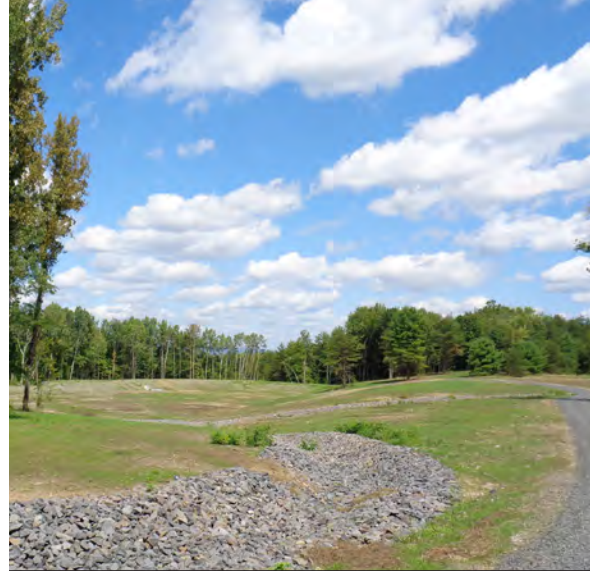
This reclaimed section of Hanover 9, Parcels B, C and D, is ready for reuse.