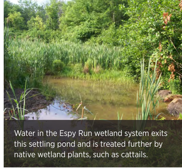
Water in the Espy Run wetland system exits this settling pond and is treated further by native wetland plants, such as cattails.

Hanover 9 Reclamation Project, Phase II, Parcels B, C and D. Follow-up actions on additional Hanover 9 parcels involve filling pits, grading and recontouring. The entire Hanover 9 site is intended for mixed-use development, including recreational and green spaces. Total project cost: $1 million.