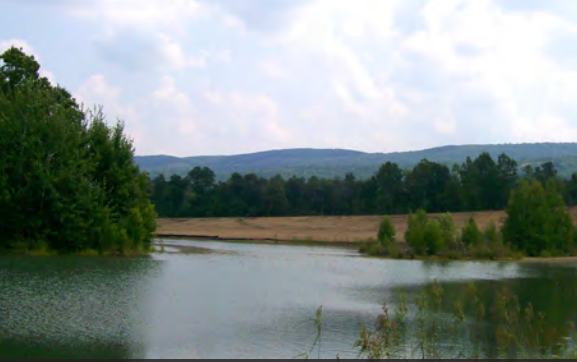
The pond at the Concrete City site is transforming into wetland habitat as part of its recovery from acid mine drainage.

“ Starting with one large piece of mine-scarred land, Earth Conservancy’s unique approach to brownfield redevelopment has been to parcel off and address the contamination on the property piece by piece, with a variety of reuses and outcomes to benefit the community. ”