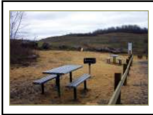
The Penobscot Ridge Mountain Bike Trail features two trailheads each with picnic and parking areas.

Planning funds for the project were provided by the Luzerne County Office of Community Development. Construction funds were provided by the Pennsylvania Department of Transportation. McLane Associates performed the design work.