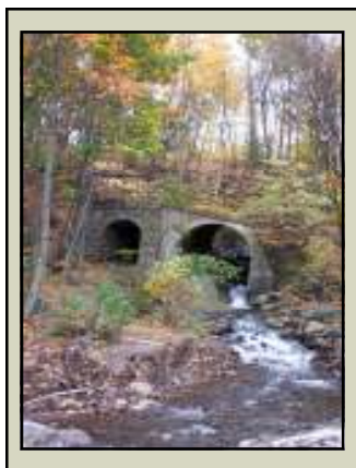
A portion of the Sugar Notch trail.

The trail will travel through the Sugar Notch residential development and end in the Greater Hanover Area Recreation Park. A trailhead will be placed adjacent to the Holy Family Church Cemetery,