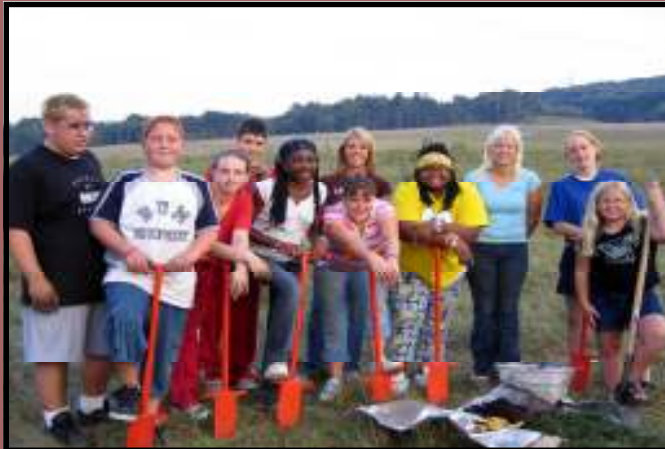
Students and teachers from the Children Service Center finish an eve-

from May through October. Interested Luzerne County residents can sign up by calling 823-3445.