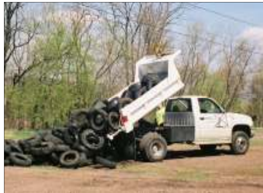
More than 300 tires were removed from sites as part of the stream cleanup.

EC operates a leaf and yard waste compost facility that is open to the public. Call 736-6609 for details.