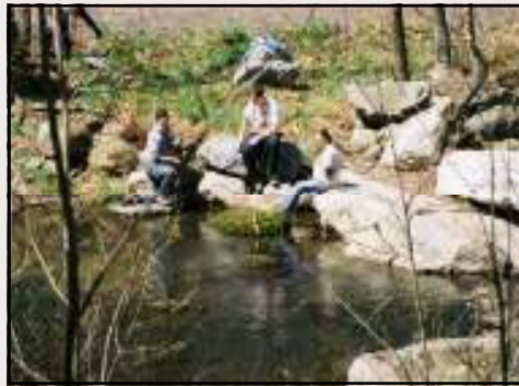
Visitors relax along Solomon's Creek in the Ashley Planes.

For the project, EC is partnering with Luzerne County, the Pennsylvania Department of Conservation and Natural Resources, Penn DOT and the Delaware & Lehigh National Heritage Corridor to complete the project. Ashley Planes will become a Luzerne county park when completed, with the County assuming ownership and operation.